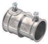
Zinc Die Cast